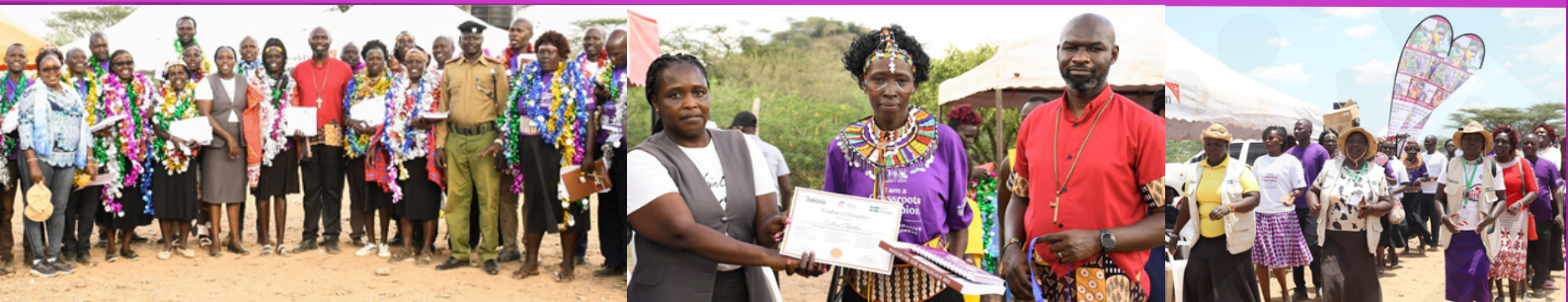
From left to right: A group photo of the newly graduated paralegals from Baringo, joined by our partners from the County Government, CIM, and LRI during the paralegal graduation ceremony held in Tiaty in September.

This work continues to lay a strong foundation for community-owned justice, ensuring that families especially women and girls can access timely support, reliable information, and pathways toward peaceful resolution.