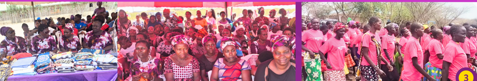
GROOTS Kenya Women Leaders at the Kilifi and Baringo International women's Day Celebrations ( Left to Right)

Across both counties, the message was clear—grassroots women are central to achieving gender equality, community resilience, and inclusive development.