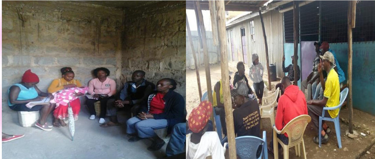
Citizen hearing Mwiki and Mathare

GROOTs Kenya champions used the opportunity to interact and share their views with different members of the Parliament sharing their experience and understanding of SDGs at the grassroots. Gaps were discussed that were to be addressed at the grassroots level