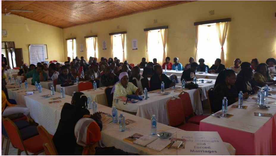
Strengthening the SDGs Kenya Forum induction meeting

‘When women understand the budget making processes and basic principles of government funding on development priorities, they will be better informed on the impact of each intervention on women and men, girls and boys. ‘