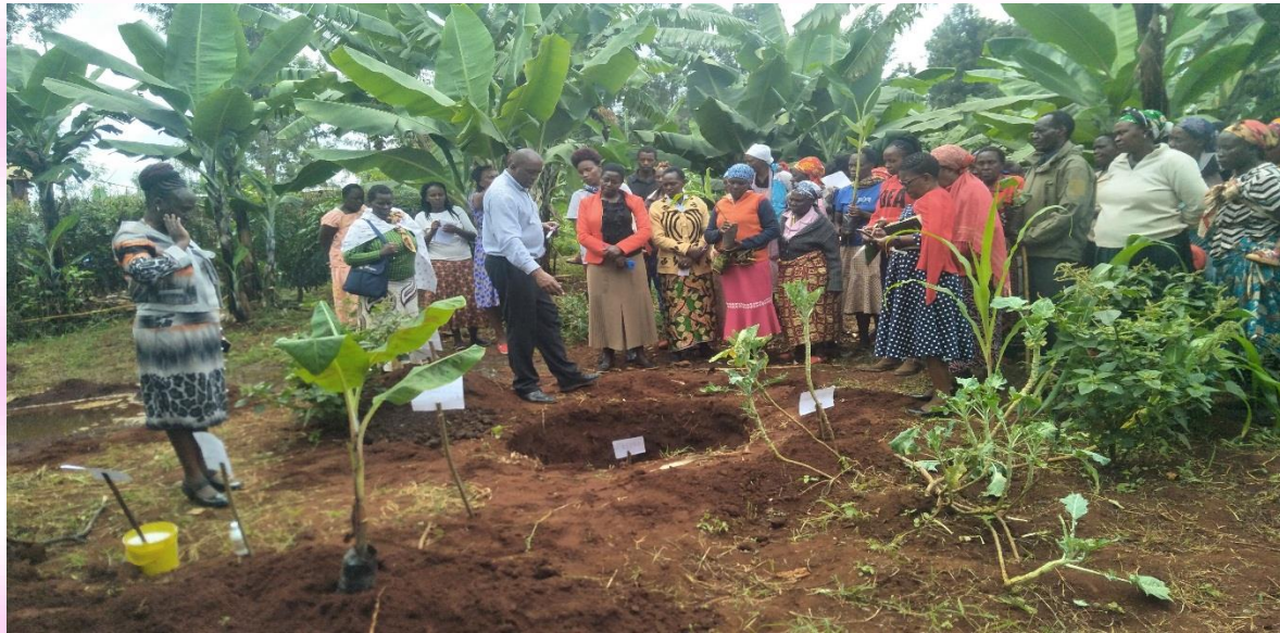
Photo: Agricultural extension Officer demonstrates how to plant a banana

agricultural officers visited farmers in Muranga and collected data on farming production, and developed and tested a banana curriculum. They are currently training farmers through demonstration plots with majority of the farmers slowly adapting to more resilient practices.