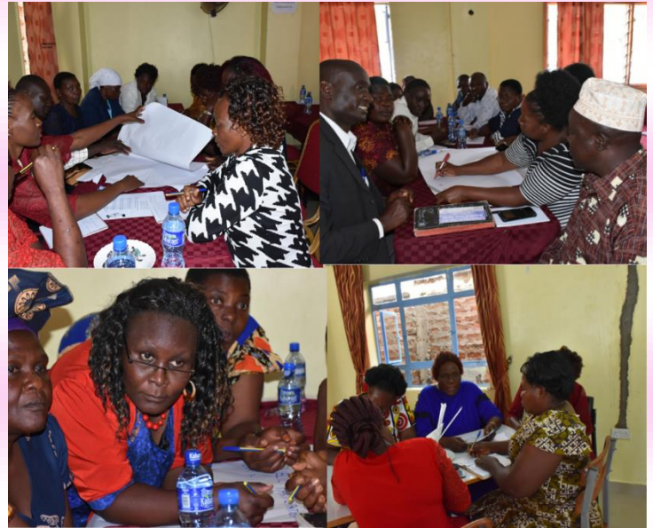
Group Discussion during the capacity building

By educating the public and especially women on their civic rights & responsibilities as well as providing a platform on which to communicate in a timely and productive manner with County Government officials, women who are traditionally and routinely left behind were not only involved in the governance process but were able to influence decision making. Most importantly, the women champions were able to influence budget allocations towards